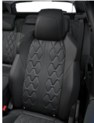
Mistral Nappa leather trim