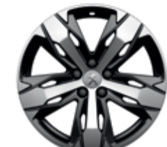
18" 'Los Angeles' with Advanced Grip Control