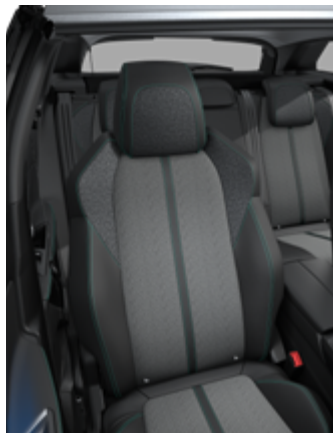
Half Leather effect trim with Mistral 'Colyn' cloth seat trim