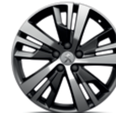
18" 'Detroit' Gloss Black Standard on GT & PHEV