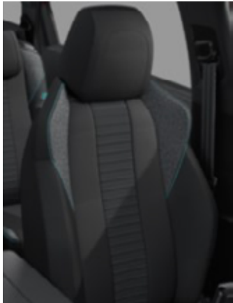
Mistral 'Pneuma' fabric trim