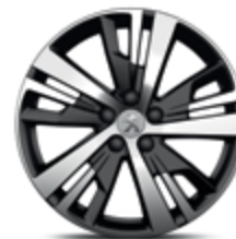
18" 'Detroit' Storm Grey Standard on ACTIVE & ALLURE