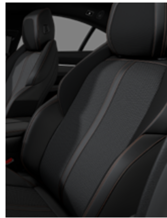
Mistral tri-material 'Belomka' leather effect and 'Ornis' cloth