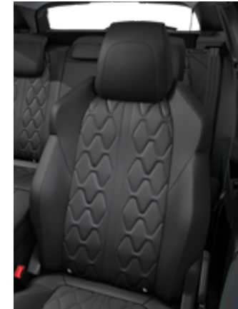
Nappa Mistral full grain leather trim