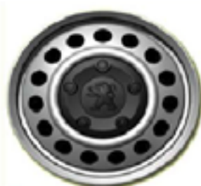
16" steel wheel with black centre cap