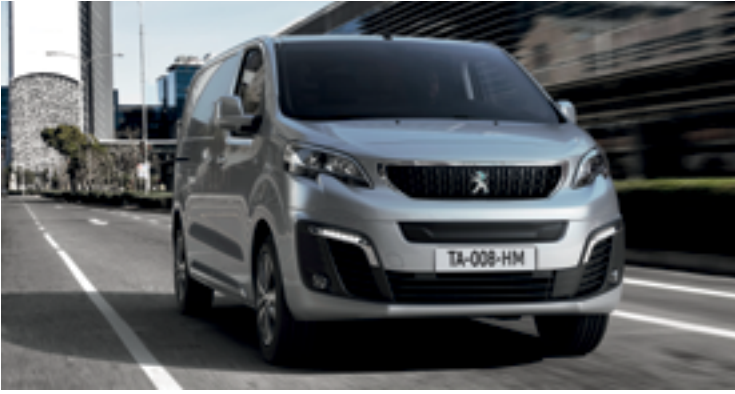
PEUGEOT e-Expert Front View