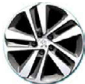
17" Diamond cut alloy wheels